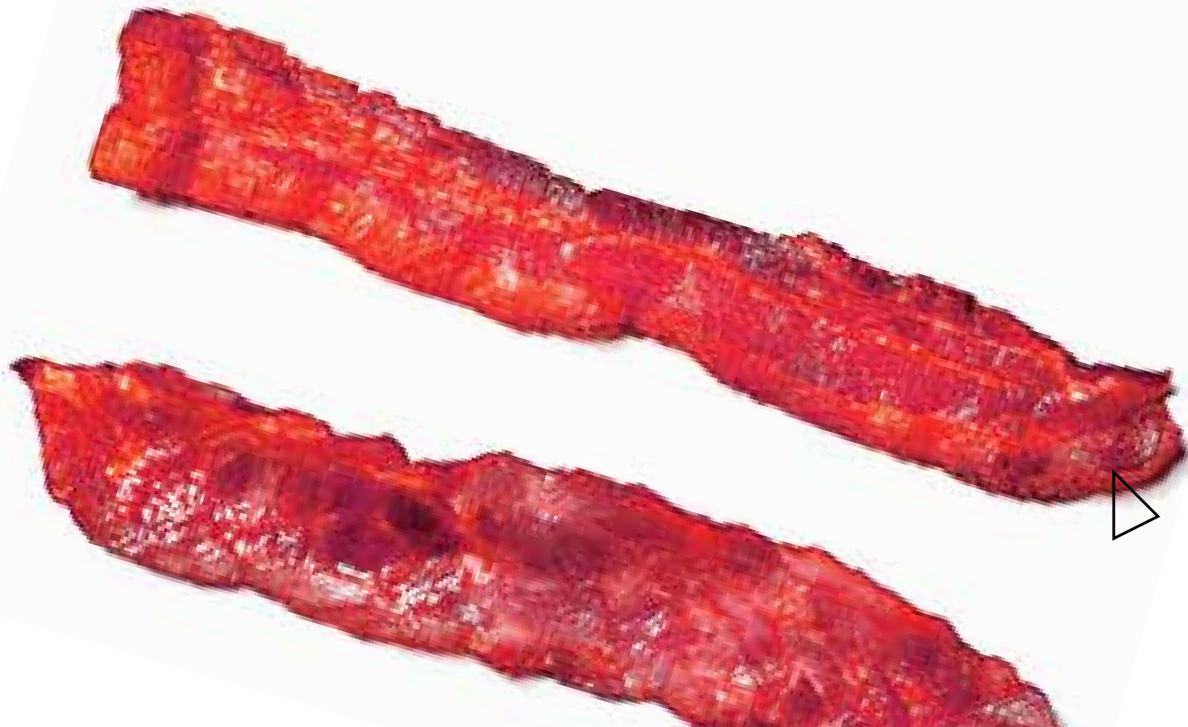
Sound of alarm clock